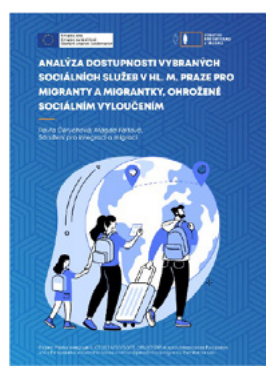
Analysis of the Availability of Selected Social Services in the Capital of Prague for Migrants at Risk of Social Exclusion